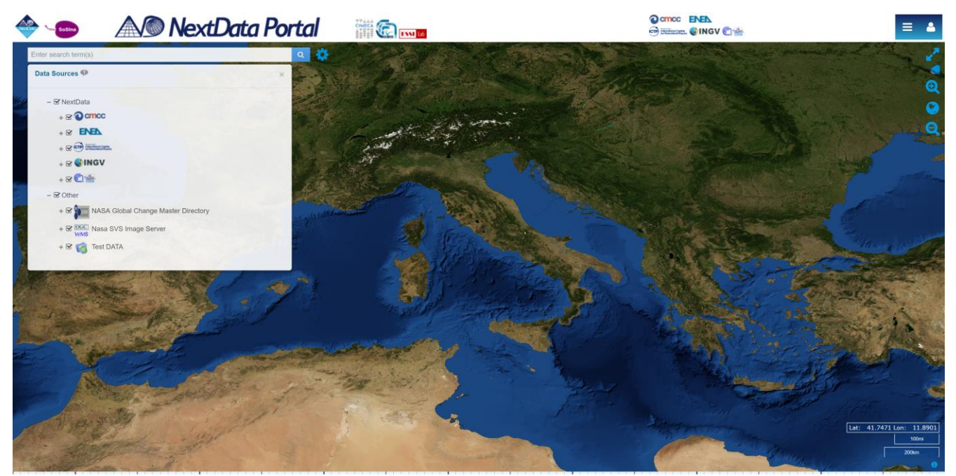
Figure 1 The NextData Portal and connected data sources

As a result of this activity NextData user can access the portal at the URL <u>http://nextdataproject.hpc.cineca.it/</u> to fully exercise the functionalities of the NextData System of Systems Infrastructure (ND-SoS-Ina). The NextData portal is the entry point for the NextData System of Systems Infrastructure (ND-Sos-Ina) as shown in Figure 2.